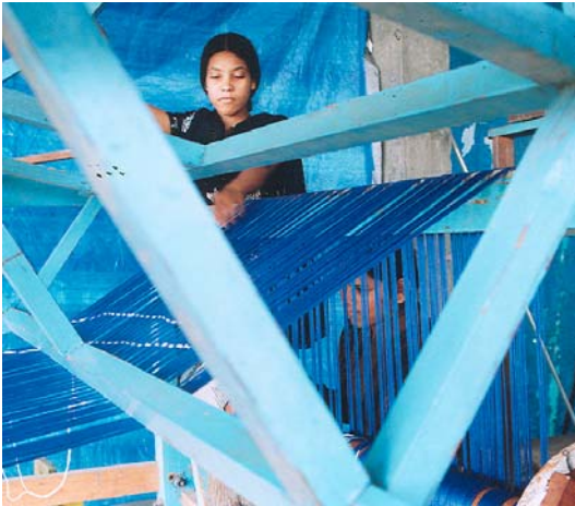
Panel of Ariadne's Prayer woven in India