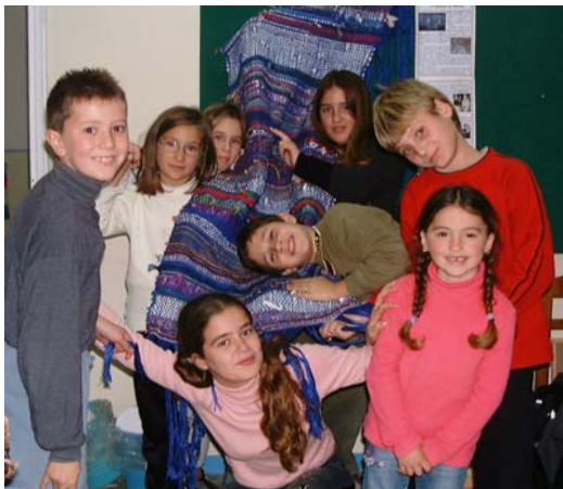
Greek Children with a panel of Ariadne's Prayer

Threads have been pulled from the fabric of people's every-day lives, from their clothing, fishing rods, shoes, blankets, animals, baby booties, guitars and hundreds of other sources.